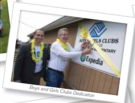
Boys and Girls Clubs Dedication