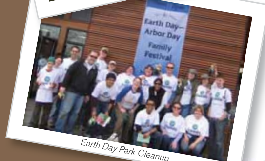
Earth Day Park Cleanup