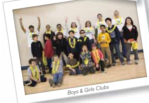
Boys & Girls Clubs