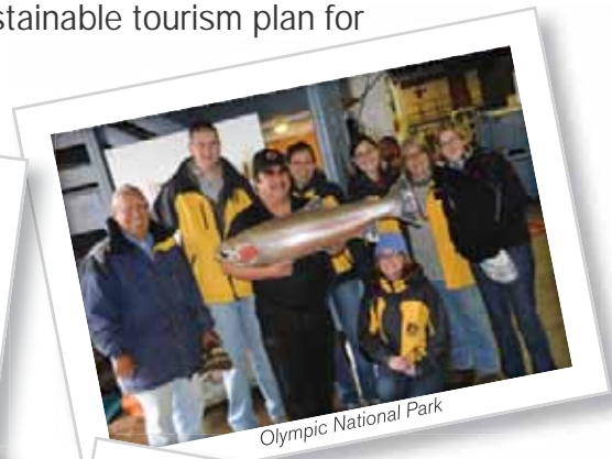
Olympic National Park