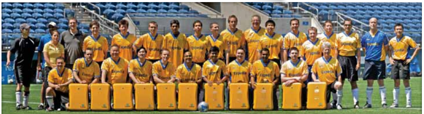
Puget Sound Corporate Soccer Challenge Benefitting Ronald McDonald House

Offset by Expedia consumers via the TerraPass carbon offsets program on Expedia points of sale