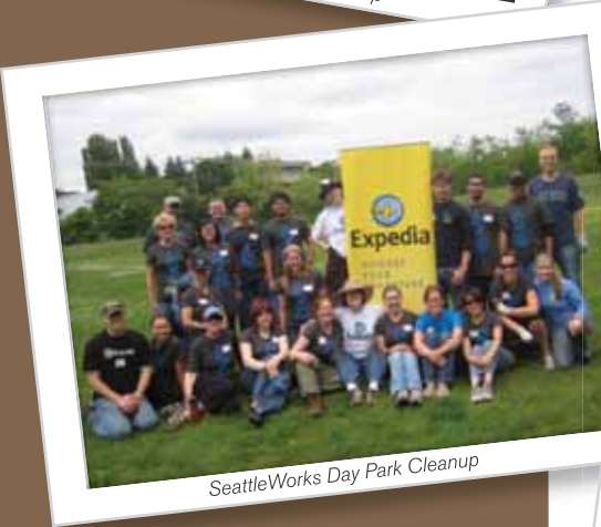
SeattleWorks Day Park Cleanup